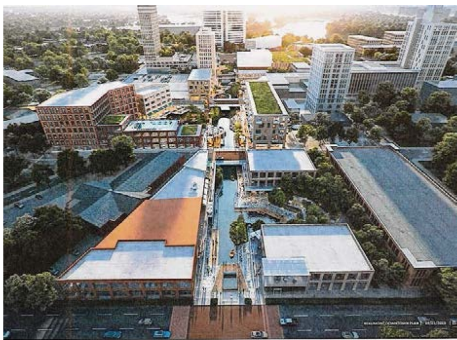
Renderings courtesy of SWA

Early cost estimates, which do not account for possible future inflation, include nearly $114 mil-