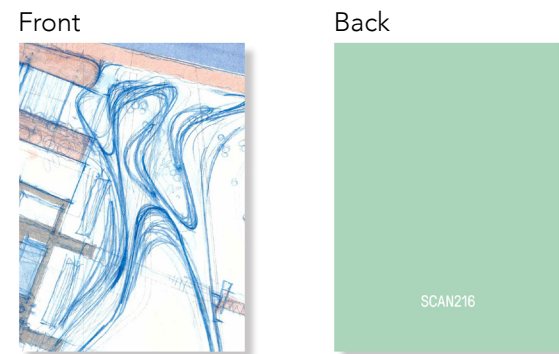
LEFT A random collection of traces from across the firm. TOP Double-sided cards link traces to studios. BOTTOM Seven decks of cards for categorization.

Following aggregation is the tool of categorization. The traces are randomly pared down to 52 samples per office and formatted into a deck of cards. One side of the card features a trace and on the other side a color, indicating the studio in which the trace originated. A unique name is then given to each card linking it to a specific project. With all seven decks, the studios organize and sort the cards according to common threads found throughout the firm-wide inventory.