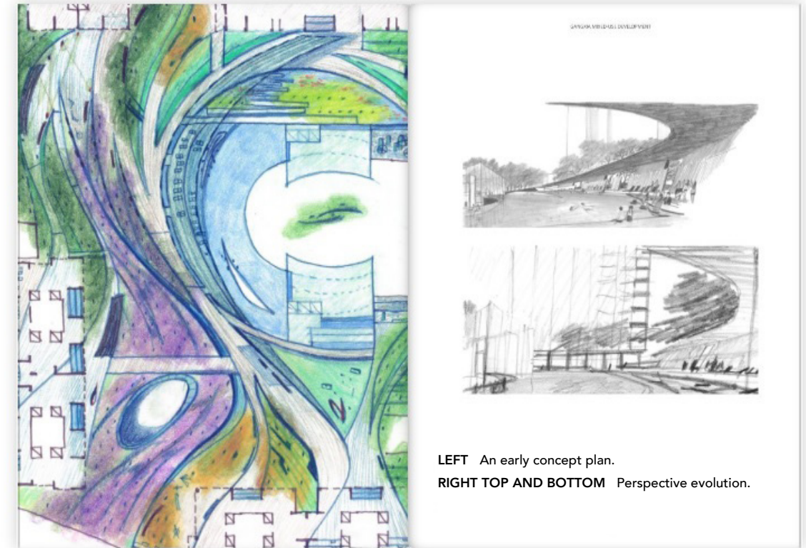
LEFT An early concept plan. RIGHT TOP AND BOTTOM Perspective evolution.

Conceptualized as a "core sample" of SWA's seven studios, the first tool aggregates one year of firm-wide traces. This process of aggregation is intentionally anonymous, with no direct connection to employees or projects. Anonymity ensures a diversity of designers, drawing typologies, and project phasing, providing a wide range of content, from highly analytical diagrams to conceptual perspectives. Once collected, the traces are publicly exhibited, revealing candid snapshots of a daily design process, regardless of employee position or stage in project development.