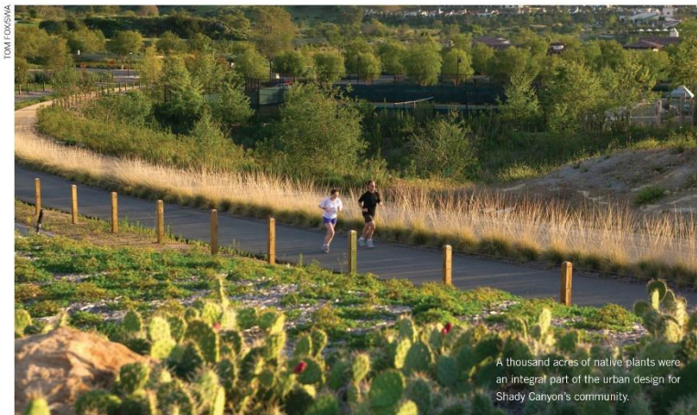
A thousand acres of native plants were an integral part of the urban design for Shady Canyon's community.

A: Do it one city at a time. We have some very unique ecological structures to build from. There are chaparral in the local coastal hills, beautiful creeks and drainage ways. Most importantly we have a