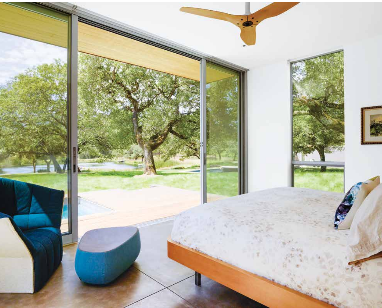
Above: The master bedroom offers expansive views of the grounds and the pond. A custom Douglas-fir bed pairs with a Ligne Roset chair and Moroso ottoman in the calming space.