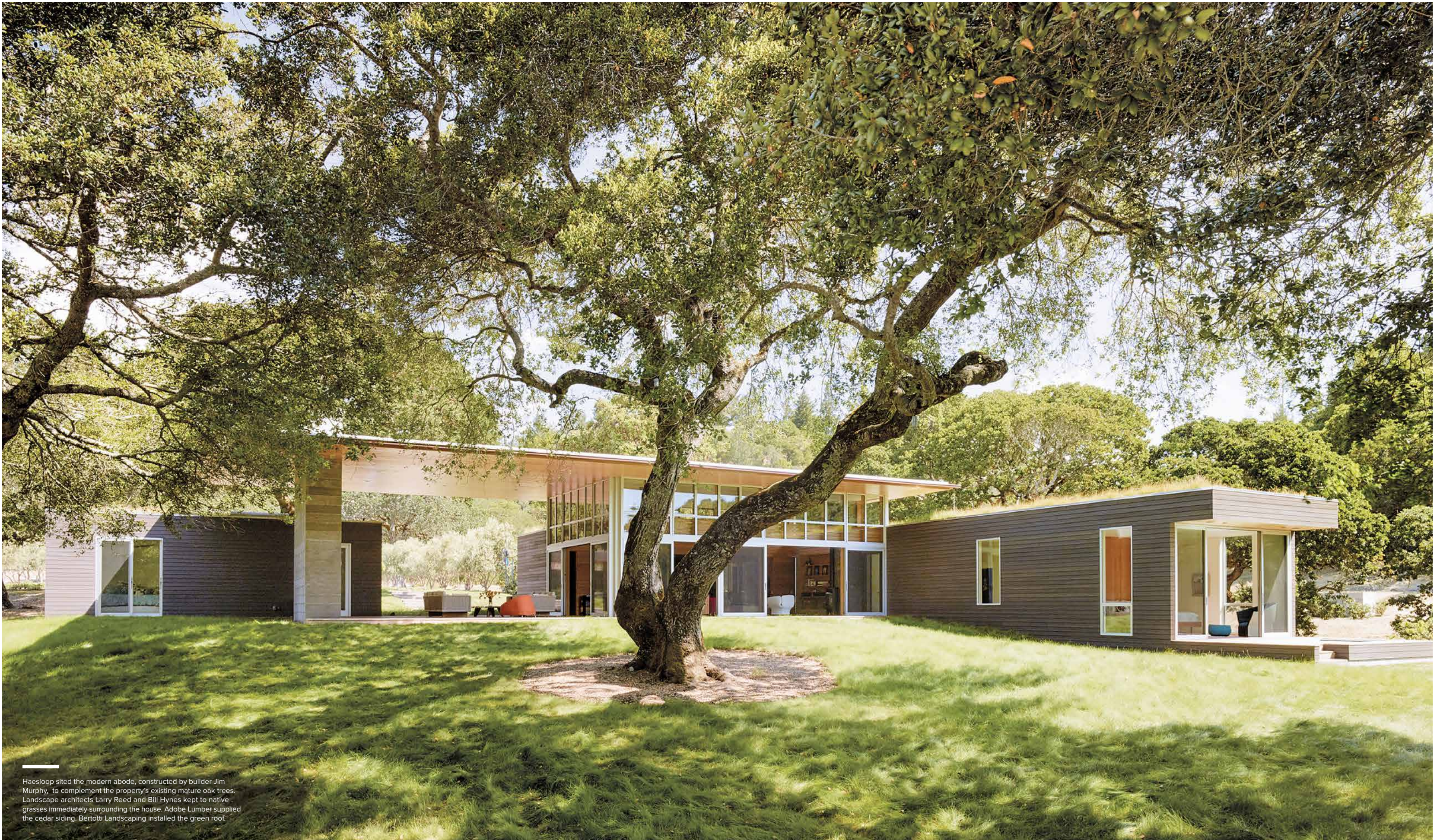
Haesloop sited the modern abode, constructed by builder Jim Murphy, to complement the property's existing mature oak trees. Landscape architects Larry Reed and Bill Hynes kept to native grasses immediately surrounding the house. Adobe Lumber supplied the cedar siding. Bertotti Landscaping installed the green roof.