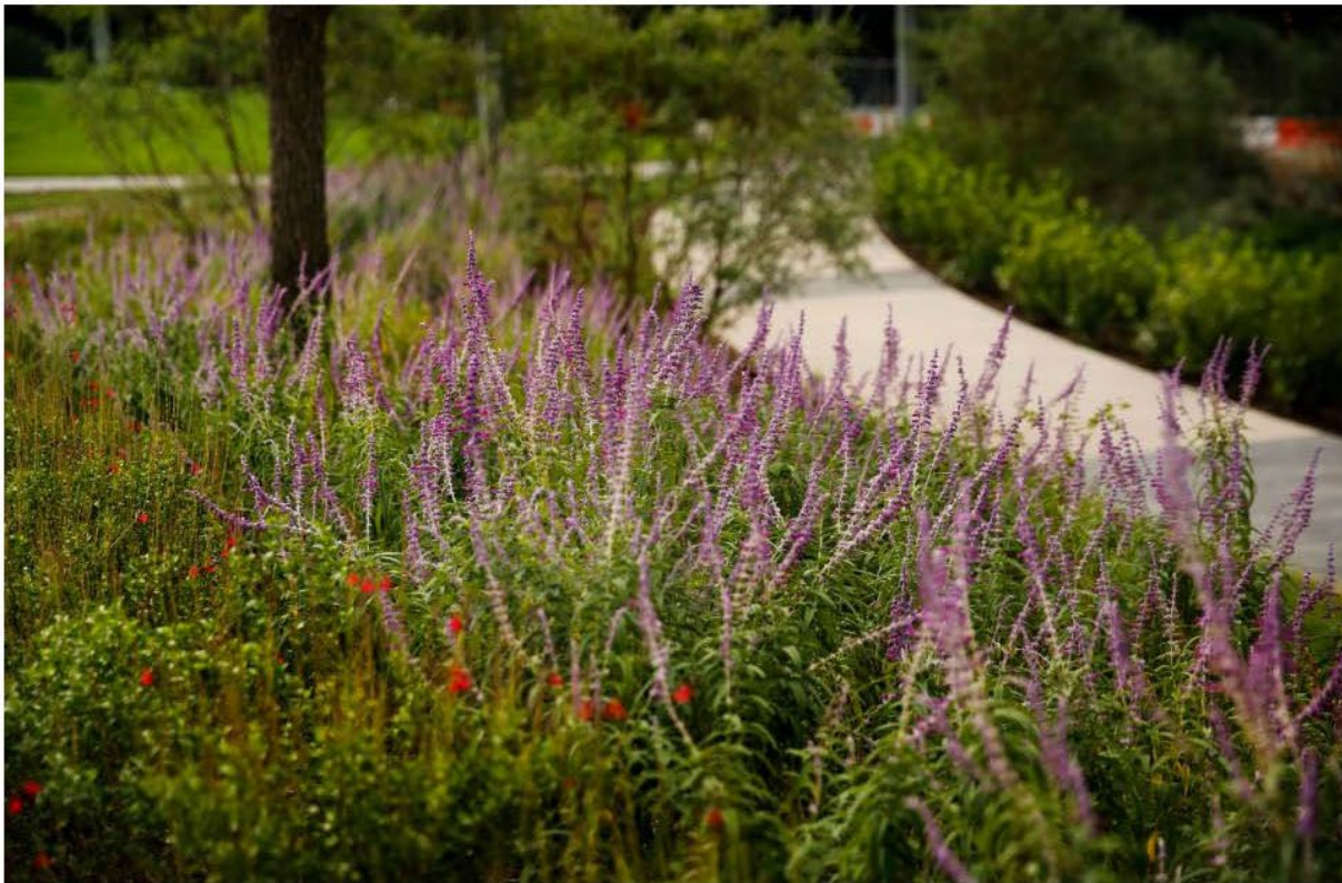
Pathways in Pacific Plaza are lined with various native, adapted, and waterwise plants.

Although the footprint of the park is relatively small, it is rich — though not overstuffed — with amenities. At its center is a 1-acre lawn suitable for picnicking or an impromptu game of touch football. The play space has been designed for kids of all ages, with a colorful soft surfacing and swings that hang from cartoonish bright orange stanchions that look like they were drawn by Dr. Seuss.